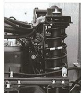
Coil Type Cab Suspension

The driver's seat features a generous horizontal slide and pitchless height adjustment. The ergonomically designed Air Suspension seat with